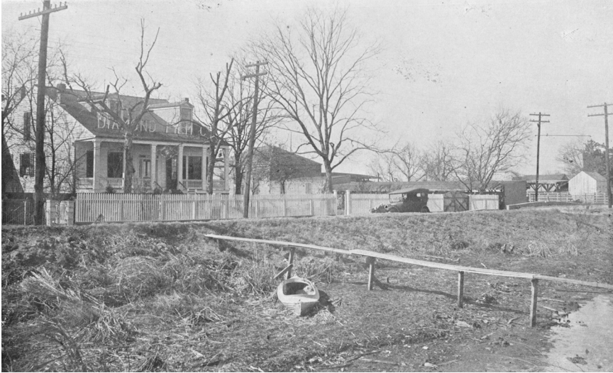
FIGURE 2. Area targeted for neighborhood development in Bayou St. John in 1917. In Diamond Film Company, Filmland: The Kingdom of Fabulous Fortunes (New Orleans: Schumert-Warfield-Watson, 1917).

Among this land was Bayou St. John, our second setting. This area was a narrow lake outlet connected to the Mississippi River via a sliver of raised land in an otherwise swampy area. Providing natural protection for boats, the bayou had been important to the early development of New Orleans. Now, however, the area was both underutilized and filthy. On the riverside bank, light industry connected to a freight railroad line and cargo holds on the water. Dumping and drainage polluted the waterway so badly that it would have to be closed for an environmental cleanup less than a decade later. Beyond this, development was sparse. Next to a marble yard sat a church, its orphanage, and horse stables. On the lakeside bank there were a few old plantation homes that owned the surrounding land, a rowing club, and a rifle range. 5 The area was known to many gentlemen a generation earlier as a secluded place to conduct duels. At this juncture, though, it was among the beacons for a widespread metamorphosis of the urban landscape. Land values soared as realtors predicted a housing boom that would extend from the busy downtown to the lakefront. 6 Farms parceled their land to eager developers. Planners had outlined a grid of streets extending up to City Park, a preeminent example of urban green space both in New Orleans and nationally. The redesign of