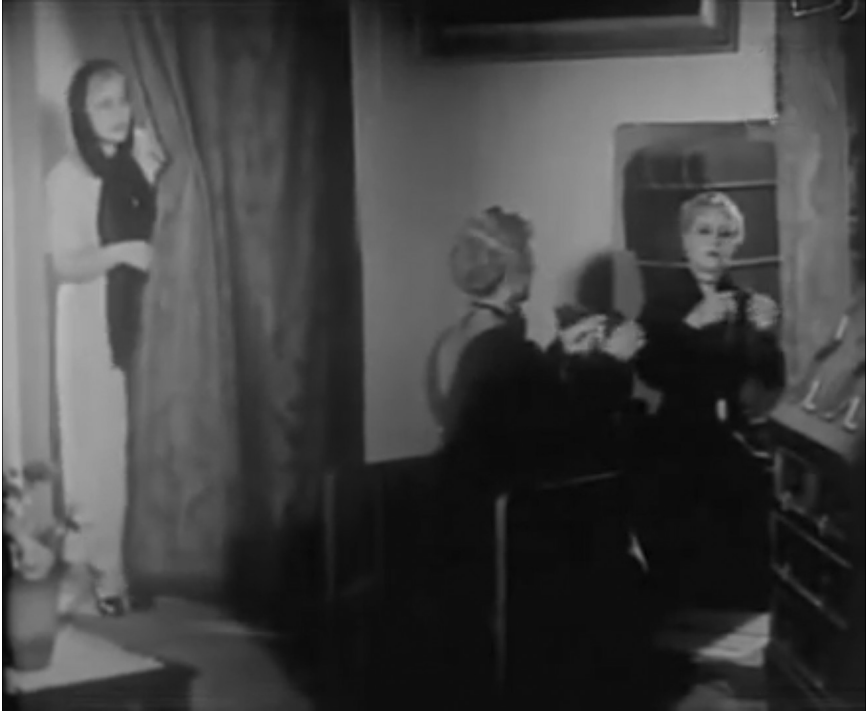
FIGURE 16. Nahid (Assia Dagher) watches Amina (also Assia Dagher) put on jewelry. Screen-shot from Wife by Proxy (Ahmad Galal, 1936).

into motion an extended masquerade. In Wife by Proxy , Nahid (Assia Dagher), a Lebanese country girl fleeing an arranged marriage, stows away on an Alexandria-bound passenger ship anchored in Beirut's harbor. The wealthy Egyptian Amina Hanim (also Assia Dagher) is returning home from a vacation in Istanbul. Nahid and Amina, both played by Assia Dagher, of course resemble one another (fig. 16). A Jewish jewel merchant named Cohen shows his wares to Amina Hanim and permits her to take some pieces back to her cabin to try on. Meanwhile, skirting away from a suspicious crew member, the stowaway, Nahid, takes refuge in Amina's cabin. There, she witnesses Amina's murder at the hands of a jewel thief. Recognizing her resemblance to the deceased, Nahid does the only sensible thing under the circumstances: she dons Amina's gown and strides into the ballroom, assuming her identity. On the boat, Nahid confronts the thief and insists that he return the jewels to Cohen. After disembarking, the thief, who has recognized Nahid, tries to blackmail her with threats to reveal her true identity. Nahid eventually metes out justice, shooting the jewel thief just as he had shot Amina.