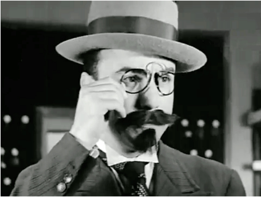
FIGURE 18. Hilmy in disguise as Doctor Hilmy. Screenshot from Doctor Farahat (Togo Mizrahi, 1935).

To add to the confusion, upon Hilmy's arrival, he dodges reporters by asking an employee of the hotel, Farahat (Fawzi al-Gazayirli), to assume his identity. The impoverished and uneducated Farahat has been employed as a translator by the hotel under false (and humorous) pretenses. Nevertheless, the ruse succeeds: the reporters snap Farahat's picture, convinced they have taken the photo of Hilmy, setting in motion this additional plotline of mistaken identity.