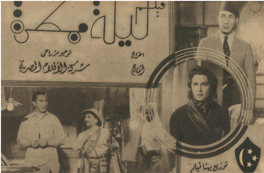
FIGURE 35. The bottom left image in this collage shows Ahmad (Yusuf Wahbi, left) and Shahata ('Abd al-'Aziz Ahmad, center) in Omdurman; also pictured, Ahmad dressed as an effendi (top right) and Saniya (Layla Murad, bottom right). Pressbook for A Rainy Night (Togo Mizrahi, 1939).

through the trials of labor in the colony. The portrayal of Sudan in this albeit uncritical colonialist idiom problematizes the widespread political acceptance in interwar Egypt of Egypt's right to rule Sudan (as discussed in chap. 5). The Egyptian experience in Sudan is rendered through a British colonial lens—raising, but ultimately not answering, questions of colonial legitimacy, sovereignty, and territoriality of nation and state. I have been arguing that A Rainy Night attempts to define the boundaries of what it means to be Egyptian. The Sudan itinerary, I argue, serves to problematize the definition of Egypt's geographical boundaries.