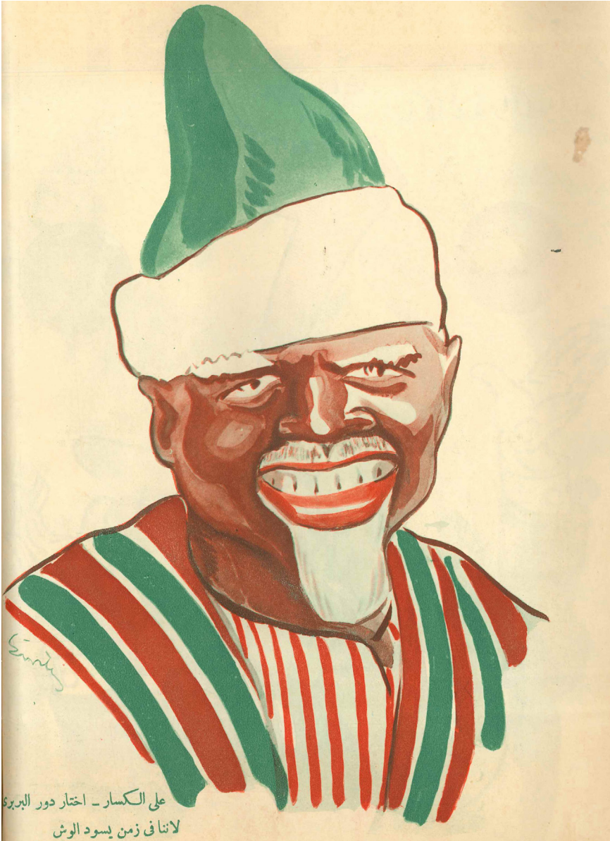
FIGURE 31. Caricature of 'Ali al-Kassar in blackface. The caption reads: "'Ali al-Kassar—I chose the role of the barbarian because we are in a time that blackens the face." Al-Ithnayn , 13 August 1934.

toward Egyptian independence. Negotiations concluded in August 1936, four months before ratification, so the terms of the treaty were discussed and debated in the press. 17 In October 1936, less than two weeks before the release of al-Kassar's film The Neighborhood Watchman , Togo Mizrahi hosted a party celebrating "the