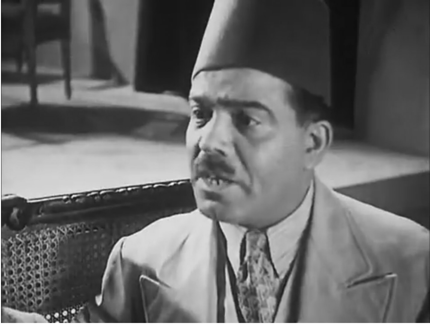
FIGURE 14. 'Ali al-Kassar in his double role as the crime boss. Screenshot from The Neighborhood Watchman (Togo Mizrahi, 1936).

comprehend that they are helping to circulate counterfeit bills printed by the gangsters. They are unwitting agents of exchange.