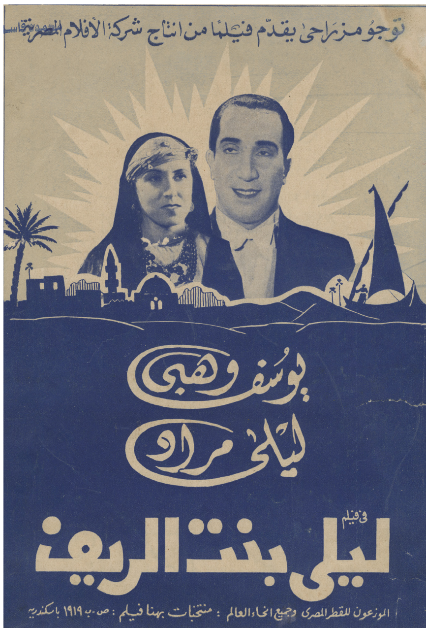
FIGURE 40. Pressbook for Layla the Country Girl (Togo Mizrahi, 1941).