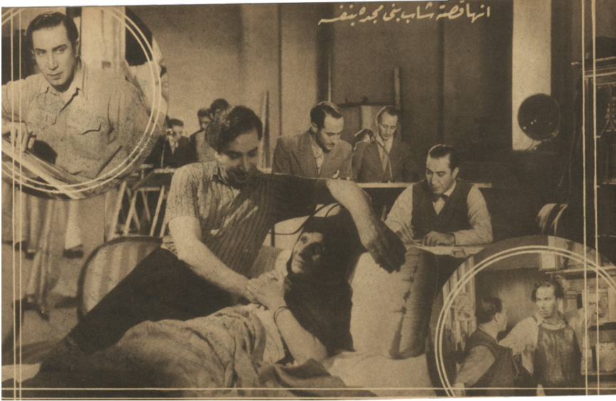
FIGURE 34. A collage, entitled “The Story of a Self-Made Man,” shows Ahmad (Yusuf Wahbi) in his many guises: devoted son (center left); engineer at a firm in Italy (center right); mechanic (lower right); and engineer for colonial project in Sudan (upper left). Pressbook for A Rainy Night (Togo Mizrahi, 1939).

Ryzova calls an effendi narrative—a narrative that becomes even more popular in Egyptian cinema during the following decade. 16