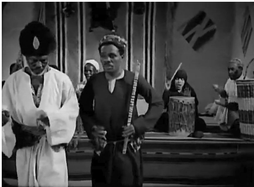
FIGURE 32. Performers at a wedding celebration in Aswan. Screenshot from Seven O'Clock (Togo Mizrahi, 1937).

blackface stage persona, he may here, too, implicitly lay claim to Sudanese ancestry. But we also can't ignore the way this footage exoticizes Nubia for the urban Lower Egyptian viewer, and fails to distinguish between distinct Afro-Muslim cultures.