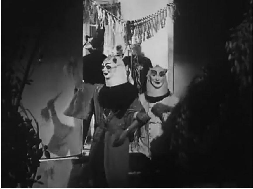
FIGURE 12. Revelers leave a costume ball. Screenshot from The Neighborhood Watchman (Togo Mizrahi, 1936).

out, vice versa, upside down, such is the direction of all of these movements. All of them thrust down, turn over, push headfirst, transfer top to bottom and bottom to top, both in the literal sense of space and in the metaphorical meaning of the image.” 56 The conclusion of the masquerade scene may cross the boundaries of good taste. But, following Bakhtin, we can read this elevation of the vulgar and debasement of the cinema as an embrace of the subversiveness of carnivalesque farce.