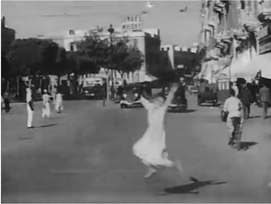
FIGURE 28. Manshiyya Square, Alexandria. Screenshot from Seven O'Clock (Togo Mizrahi, 1937).

Alexandria's eastern harbor. At the end of the shot, the camera has turned around, orienting itself inward toward Egypt, ad Aegyptum . In the diegesis, too, circular urban trajectories give way to a journey along a linear axis. From its position on the Alexandria seaside promenade, the camera points southward, establishing the trajectory of the narrative.