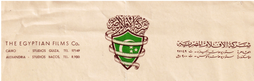
FIGURE 3. Letterhead for the Egyptian Films Company featuring the company logo.