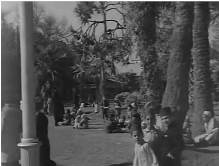
FIGURE 1. Alexandria residents relaxing in a park. Screenshot from Mistreated by Affluence (Togo Mizrahi, 1937).

The footage shows what appear to be Alexandria residents engaging in leisure activities in identifiable locales. None of the credited actors appear in the montage. Children display curiosity about the camera. The viewer is invited to read these images as authentic—even as we recognize the constructedness of the montage. Social codes of dress give the viewer cues to categorizing the individuals included in the footage. Members of the rising middle class—the effendiyya —are shown seeking entertainment and diversion alongside members of the popular classes. 2 This carefully edited montage constructs a festival day in which Alexandrians across the socioeconomic spectrum celebrate in public spaces together.