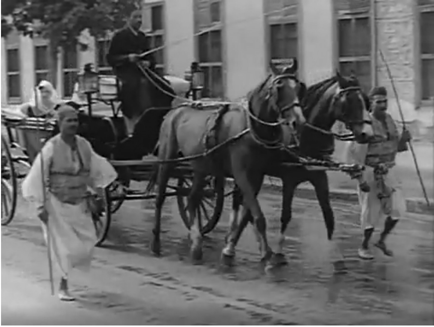
FIGURE 43. Amshagiyya accompany Layla's carriage. Screenshot from Layla (Togo Mizrahi, 1942).

shown departing by carriage from the home he shares with Layla in the country. A doctor arrives by carriage to treat Layla. Farid's father arrives and departs by carriage, framing his dramatic interaction with Layla. The film also features a carriage chase. At one point Farid storms out and rides off into the night on a simple buck-board. Layla follows after him, jumping into an enclosed carriage, a thin black veil pinned, as if in haste, to the back of her head. In this scene, as she rushes to reconcile with Farid by renouncing her reliance on the financial support of other men, Layla no longer wears the yashmak , and her carriage proceeds without the services of the amshagiyya . Within the diegesis, the loss of these royal symbols maps the character's disavowal of wealth in favor of happiness. But for the audience, the star, Layla Murad, remains associated with the trappings of royalty.