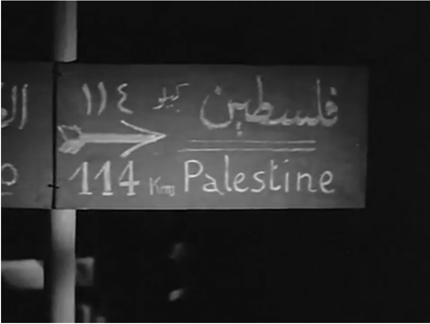
FIGURE 39. Bilingual directional sign near the customs house in Isma'iliya indicating the distance to Palestine. Screenshot from The Straight Road (Togo Mizrahi, 1943).

The accident conveniently provides cover for the later loss of the gold. A telegram sent to the Egyptian Nationalist Bank states that the driver's body was not found but that a bag and a wallet belonging to Yusuf Fahmi were recovered. The article from the newspaper Al-Jumhur that Ibrahim reads out loud in Suraya's dressing room in Beirut notes that no trace of the body or the gold has been found. The two pieces of news, delivered in Cairo and Beirut, bracket the absence in Palestine, and grant it signification: on the one hand, news of Yusuf's presumed death, and on the other, revelation of Yusuf's survival but the demise of his identity.