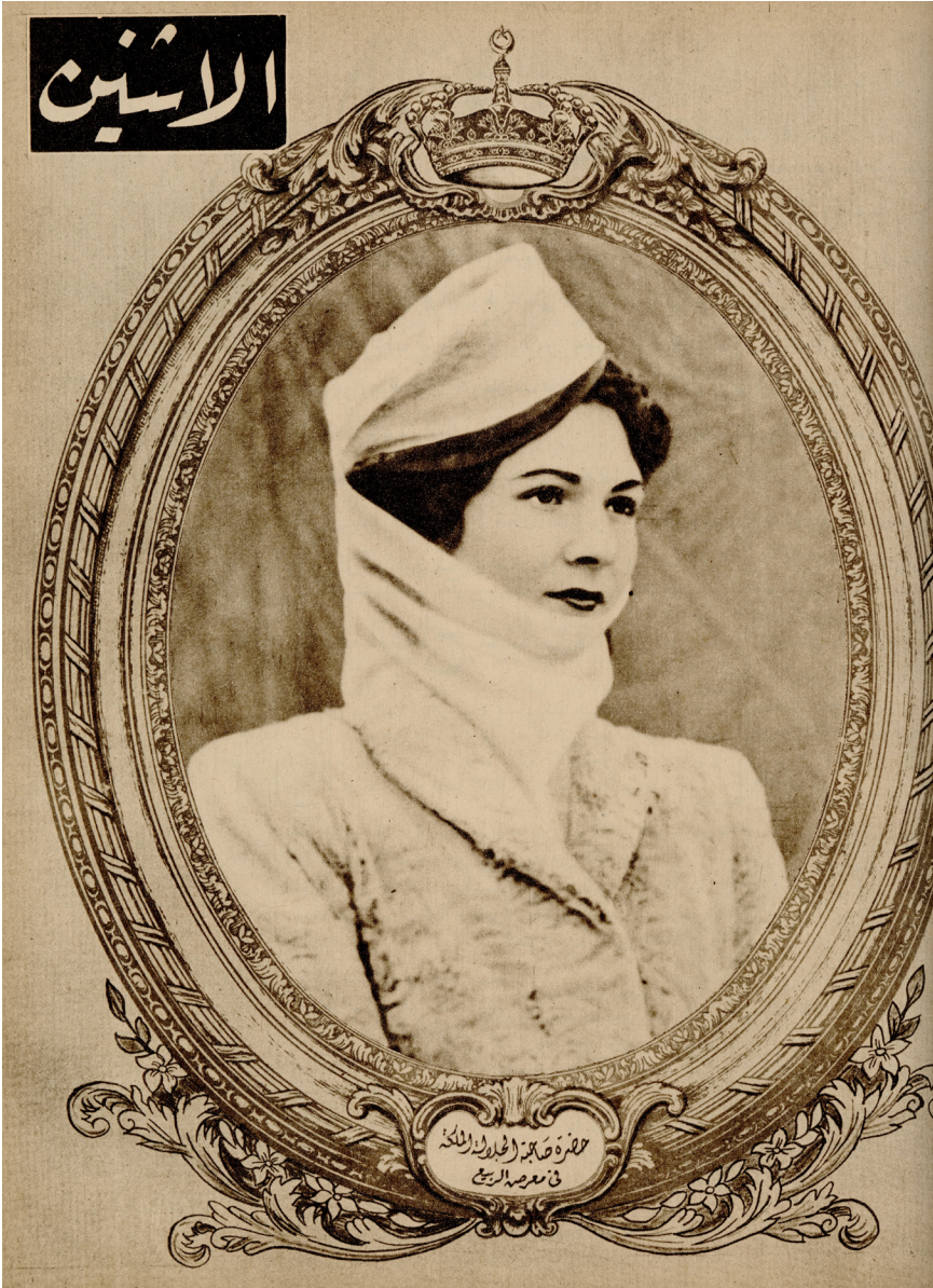
FIGURE 41. Portrait of Queen Farida on the cover of Al-Ithnayn , 16 March 1942.

and character. Visually and textually, the connection between character and star promotes the idea of Layla Murad as cinema royalty.