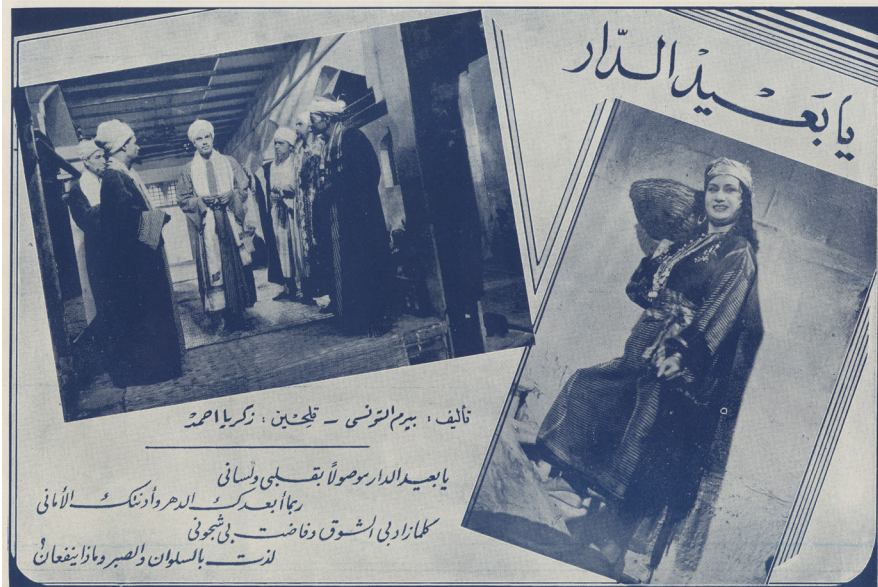
FIGURE 46. Collage: ‘Abd al-Rahman al-Qass (Yahya Shahin) in peasant dress (left, center); Umm Kulthum as Sallama (lower right). Pressbook for Sallama (Togo Mizrahi, 1945).

‘Abd al-Rahman elevates his desire by expressing himself in verse. The poem “Qalu: Uhibb al-Qass Sallama” (“They Say al-Qass Loves Sallama”), composed by Ba Kathir for the novel, adheres to traditional poetic form. 99 The short poem is modified for the film. The first line (in both versions) reads: “They say al-Qass loves Sallama / He is the pure, pious ascetic.” In the film, al-nasik , the world for “pious,” is changed to al-wara’ —a term that also implies timidity or cautiousness. In the original poem, the second line reads: “As if only the brazen, lethal seducer could already know desire.” By contrast, the version in the film eliminates the direct reference to seduction and changes the gender of the subject, replacing the line with the words: “As if only a brazen girl could know the taste of desire and love.” The poem is then set to music and sung by Umm Kulthum in Sallama’s voice. The power of the characters’ longing in the novel is reduced to the tepid, commonly accepted tropes of love and desire acceptable in popular song.