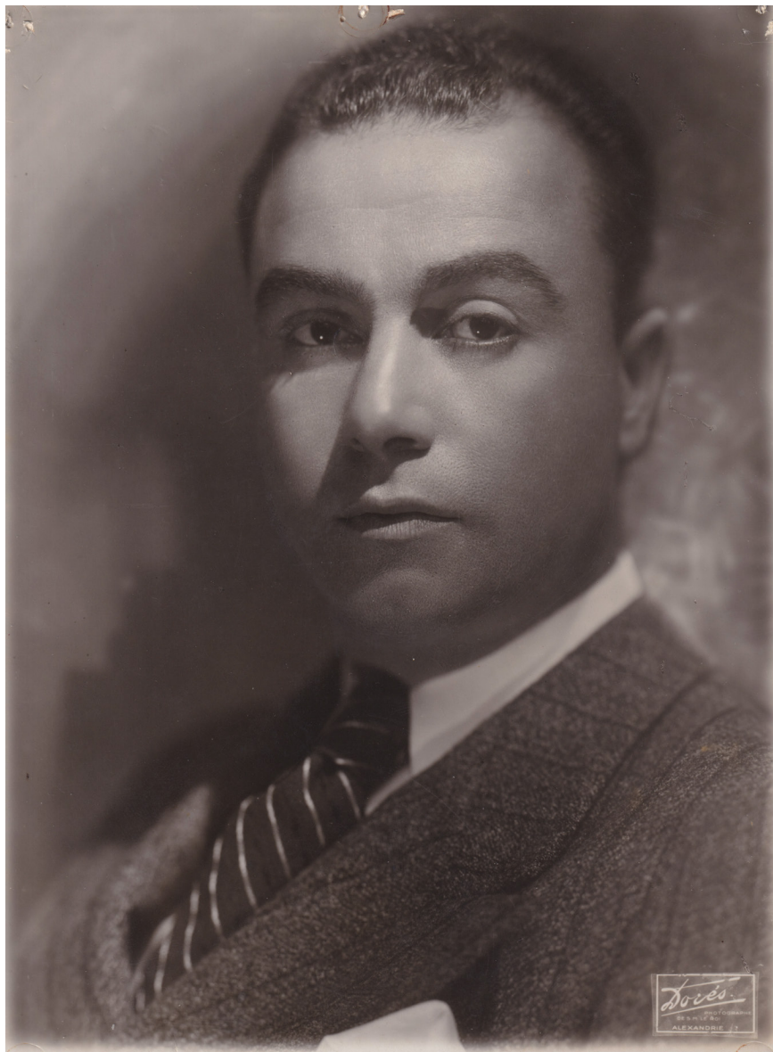
FIGURE 2. Portrait of Togo Mizrahi

later graces the same shop—as children of Egypt. This book examines the place of Togo Mizrahi, “child of Egypt,” in Egyptian cinema history.