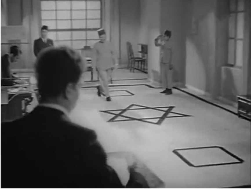
FIGURE 38. Lobby of “The Egyptian Nationalist Bank.” Screenshot from The Straight Road (Togo Mizrahi, 1943).