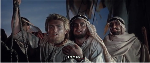
FIGURE 17. Still from Khozhdenie Zi Tri Morya (1958): Afanasy's ship reaches India.