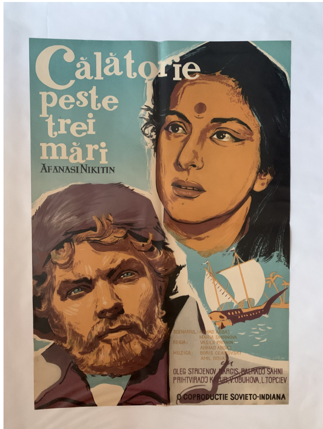
FIGURE 23. Romanian poster for Khozhdenie Zi Tri Morya (1958).

lies only in their potential to ultimately serve and invigorate a masculine, socially oriented ethos of work for its far greater scale of production.