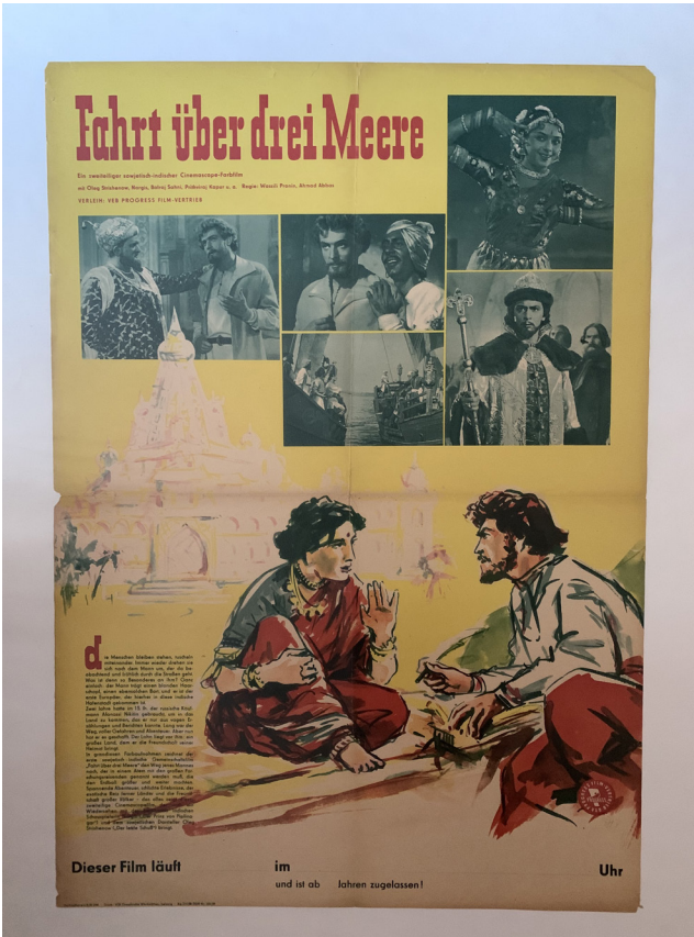
FIGURE 24. East German poster for Khozhdenie Zi Tri Morya (1958).

for—its excesses of romance, uncritically conflated in turn with the excesses of crass commercialism and consumption.