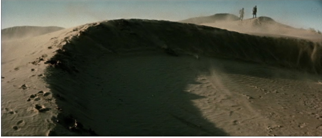
FIGURE 13. Still from Khozhdenie Zi Tri Morya (1958): Wide shot of Central Asian desert landscape.

by night and kill several of the Tver merchants in course of their bloody raid. Scholar Vadim Rudakov places such representations of Tatars as bloodthirsty barbarians among “the worst traditions of the old Soviet films.” In response to a more recent controversy that arose around the persistence of such representations, Wahit Imamov notes that such portrayals of the predominantly Muslim Turko-Mongol Tatars are historically “part of the Kremlin’s determination to use culture to promote Russia’s image as a Slavic, Christian nation.” 25 While Pardesi/Khozhdenie forwards progressive commitments to upending social ills that stem from race, class, and caste hierarchies, religious orthodoxies, and imperial greed, its progressive vision is limited by the blind spots of homogenizing representations that define and visualize Russia and India along majoritarian-nationalist lines of race, religion, and language at the expense of their myriad alternatives. Following the Tatar’s raid, Afanasy and Mikhail continue by foot, motivating wide shots of Central Asian landscapes that are at once constitutive of and marginal to a Russia-centric Soviet visual geography.