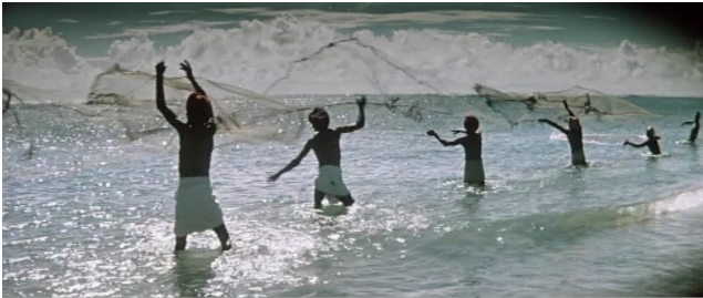
FIGURE 18. Still from Khozhdenie Zi Tri Morya (1958): Wide shot of fishermen, among other vistas upon Afanasy's arrival in India.