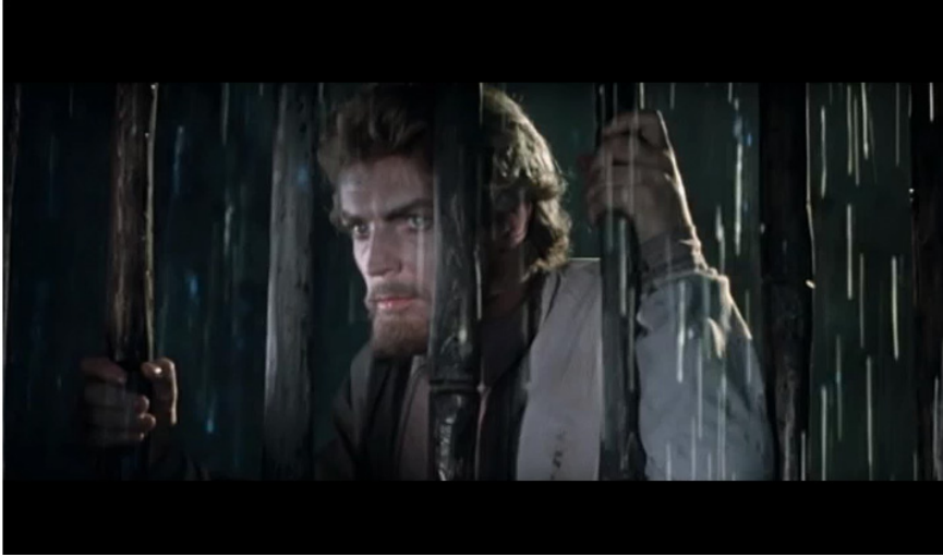
CLIP 4. Romantic dream sequence from Khozhdenie Zi Tri Morya (1958).

To watch this video, scan the QR code with your mobile device or visit DOI: https://doi.org/10.1525/luminos.130.4