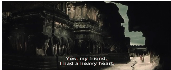
FIGURE 20. Still from Khozhdenie Zi Tri Morya (1958): Afanasy and Sakharam discuss life, love, and work.

sculptures (fig. 20). The pair surmises that the artists surely suffered the heartaches of various loves and took them to their graves, while they bequeathed to the world the fruits of their labors that have stood the test of time. Art and work are exalted in a shared masculine homosocial space of enduring legacies, while heartache is normalized as a shared inevitability and, along with romantic love, relegated to an ephemeral feminine domain of private emotions that are nonetheless valuable for their libidinal energies that can be nobly diverted into one's work.