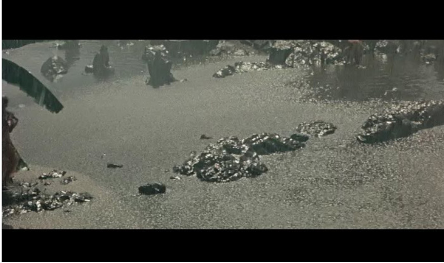
CLIP 3. “ rim jhim rim jhim barse paanii re ” song sequence from Khozhdenie Zi Tri Morya (1958).

To watch this video, scan the QR code with your mobile device or visit DOI: https://doi.org/10.1525/luminos.130.3