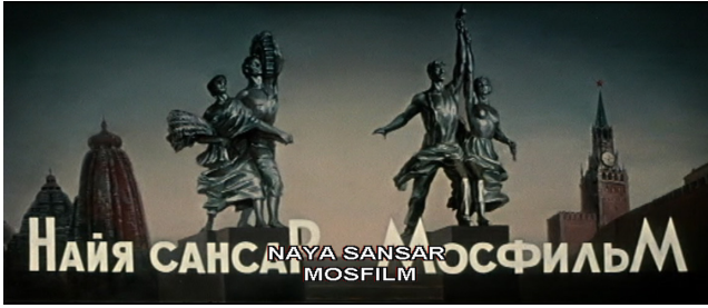
FIGURE 10. Still from Khozhdenie Zi Tri Morya (1958): Title credit.

position of prominence. Subsequent credits continue to emphasize the meticulously symmetrical nature of the film's coproduction, through multiple layers of collaboration between cast and crew from both India and the Soviet Union.