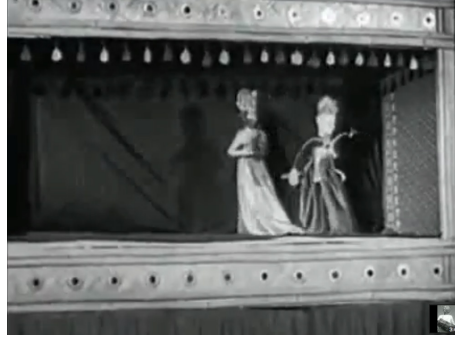
FIGURE 19. Still from Pardesi (1957): Sakharam's puppet show in the bazaar.

The song is neither dubbed nor subtitled in extant versions, and its importance is far less in its lyrical content—the “welcome to Hindustan” chorus is, after all, redundant—than in its form and its positioning vis-à-vis the audiences that are both within and outside the diegesis. The fact that the song commences in the midst of a busy open-air market dovetails with both codirector K. A. Abbas and actor Balraj Sahni's involvement with the Indian People's Theatre Association (IPTA), a Left cultural organization and affiliate of the Communist Party of India, which espoused a commitment to art directed toward the empowerment of the masses. 31 There is no diegetic motivation whatsoever for the crane shot that initially positions the audience above the dais, as if looking down from the elite balcony seats of a theatre. In the Hindi version of the film, there is even a cut to a close-up of an onstage puppet theatre that becomes the big screen for a moment, with Sakharam appearing to sing “playback” for the puppets (fig. 19). However, as soon as the chorus commences and the crowds start to join in, the camera brings the audience to occupy a ground-level position amongst the crowd, reveling in the pleasures of a peoples' participatory art form—that is, popular cinema—that aims, through its songs, to cut across the class and caste positions of its audiences and bring them together in a public space.