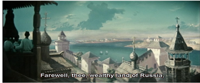
FIGURE 11. Still from Khozhdenie Zi Tri Morya (1958): Painted panorama of Russian landscape.

feminine, domestic space for a static family life that Afanasy's mother wants her son to settle into, in contrast to the dynamic allure of travel amid the fraternities of princely rulers, ambassadors, and traders. In the opening moments of the film, as Afanasy begins the writings that frame his flashback, he wonders in a voice-over whether his desire to see the world caused not only his physical but also his spiritual undoing, precipitating a fall from godliness through the temptation of a wanderlust that lands him in the lap of the devil, as his mother believes. This ambivalence over the moral value of wanting to see the world through travel and trade is continually raised, in order to emphasize the sincerity of Afanasy's wanderlust not as an end in itself but as a means of world-making through the forging of progressive-socialist solidarities across national, linguistic, and cultural boundaries.