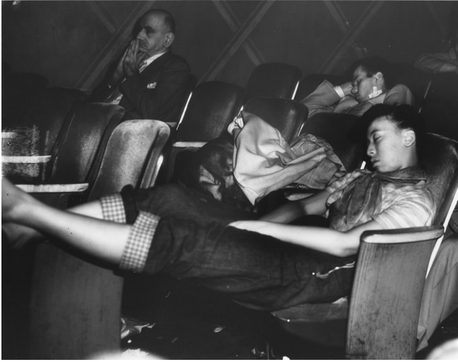
FIGURE 60. Sleeping at the Movies (Weegee, ca. 1943).

as if to carefully guard against any tell-tale signs of truancy. He maintains an air of composure even while stealing a nap—unlike the man in another of the Brief images who has completely let himself go, sprawled in an ungainly fashion across a row of seats. Another photograph, in contrast to the innocence of the sleeping children, has a seedier, even postcoital quality. Looking down from a balcony, the camera captures an unconscious man in worker's garb. His shirt disheveled, and his belt strap dangles loosely. The sleep pictured by Weegee comes in numerous varieties, wavelengths, and weights. It can be soft and floating, or leaden and profound. Its arrival exposes the postural inclinations of individual bodies, and sets into relief the physical traces of their relationship to work and rest, necessity and indulgence. It is an index of phases of spectatorship and the ways that time leaves its imprint on immobilized bodies.