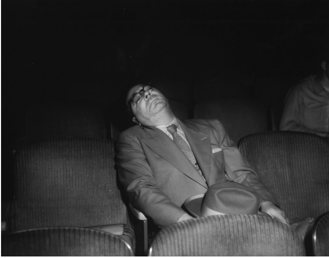
FIGURE 61. Sleeping at the Movies (Weegee, ca. 1943).

naked and vulnerable. Viewed in these contexts, the act of sleeping is shadowed by implications of vagrancy, illicitness, and disorder. Weegee refers to the proscriptive forces that threaten to disturb these vagrant sleepers while also positioning himself as their ally, looking upon and watching over them: “So sleep on stranger . . . no one will bother you . . . not even the cops . . . Sunday is a good day for sleeping—so is any other day—when one is tired.” 31 In Weegee’s People , he even inserts himself among them: the book’s frontispiece is a portrait of the author dozing on a park bench in Washington Square. 32 Across these images, the representation of sleep as a natural need shared by all bodies intertwines with the recognition of sleep as a resource that is unevenly distributed and differently accessed in a stratified society. For the unhoused, poor, and ethnic and racial minorities whose nocturnal existence Weegee documented, the guarantee of shelter is as precarious as the satisfaction of other material necessities.