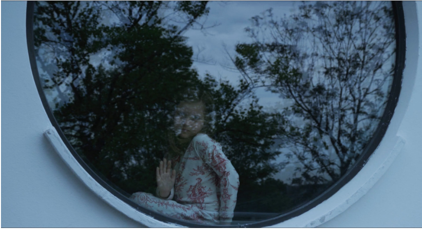
FIGURE 52. Holy Motors (Leos Carax, 2012).

eyes, as night hovers all day in the boughs of the fir-tree.” 1 Dreaming by the window, this pajama-clad figure evokes a visual lineage of children dreaming in bed.