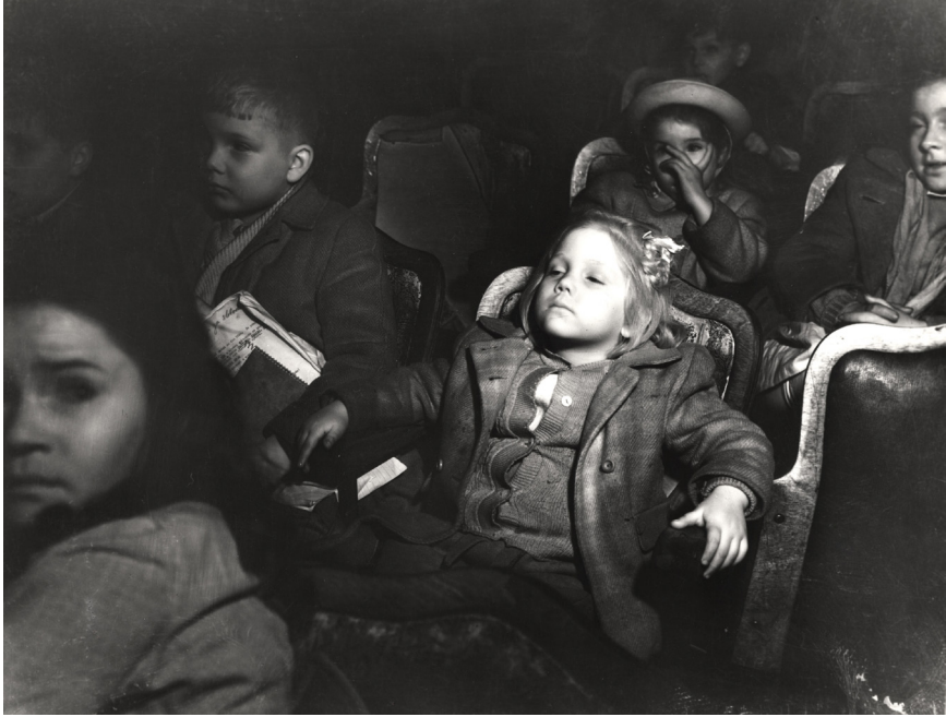
FIGURE 53. “The Children’s Hour,” from Weegee’s People (Weegee, 1946).

have reached a point of enviably peaceful relaxation. She leans back into her chair, melting into its depths, her arms flopped out on the armrests in a manner that recalls the tendency of some bodies to sprawl in their slumber. Her eyelids, like her body, droop heavily, as if the camera has caught her on the very cusp of sleep, in those final seconds just before she nods off completely.