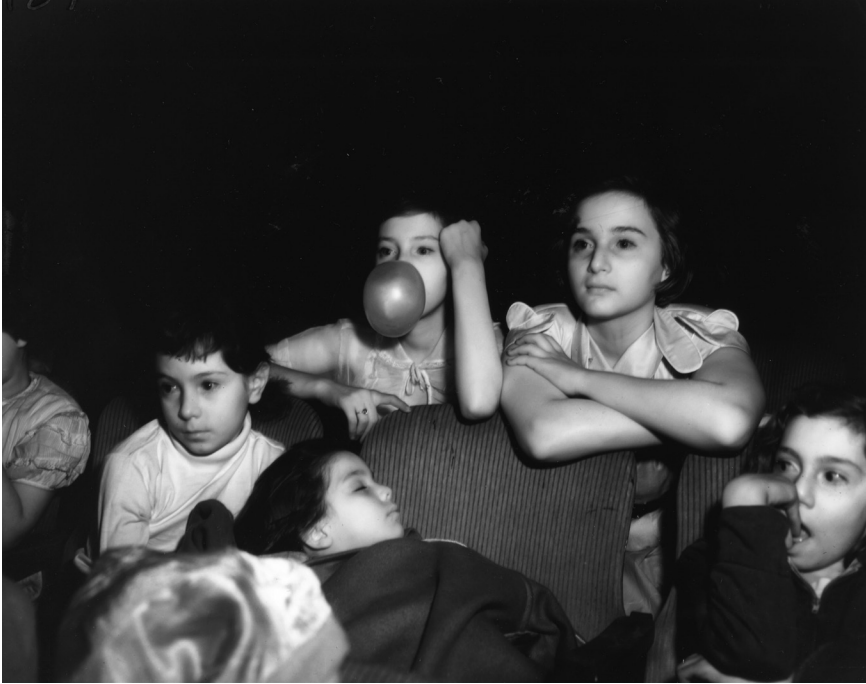
FIGURE 57. Girls Watching Movie (Weegee, ca. 1943).