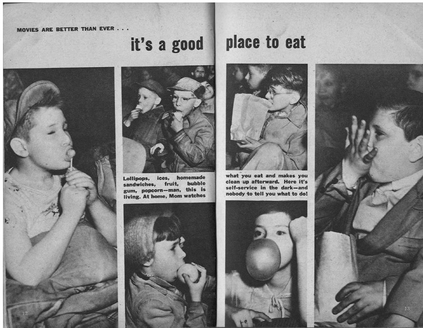
FIGURE 58. Weegee, “Movies Are Better than Ever,” Brief , October 1953.

the woman’s bare feet propped up on the seat in front of her—did not make the final cut for publication. 21