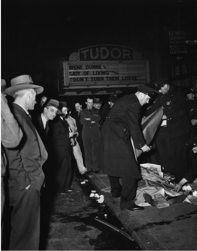
FIGURE 54. “Joy of Living” (Weegee, 1942).

of true crime, what is most compelling in his work is not the crime itself but the reactions elicited by it, as Lucy Sante has noted. The many images he made of people caught in the act of looking, their line of vision trained on a point beyond the edges of the frame, are “in many ways his truest portraits. Not only are his subjects so absorbed in what they are viewing that they give themselves to the camera, uncomposed and naked, but by virtue of the act of looking they become avatars of the photographer himself. Weegee puts himself in their shoes, and imagines them in his. They are a city of eyes, joined together by curiosity.” 6