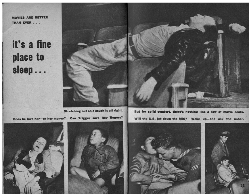
FIGURE 59. Weegee, "Movies Are Better than Ever," Brief , October 1953.

For one thing, these images seem to insist, the gratifications of cinema are oral just as much as, or even more than, they are visual. They compose a multifaceted taxonomy of this cinematic orality: chewing, blowing, munching, sucking, and licking, on gum, popcorn, candies, ice cream cones, fingers, and lips. The figures singled out for attention—like the boy in the baseball cap whose entire face blissfully contracts around the lollipop that he holds carefully with both hands—defy the reduction of the film spectator to a disembodied gaze. From the abstract ideal of the pair of eyes fixated on the screen, we arrive at the photo-documentary image of a pair of lips suctioned to a blob of sugar. To the extent that the photos offer a glimpse into the history of spectatorship, it is from a perspective that seeks out and magnifies dimensions of the experience that are elided by accounts of film reception as "a particular system of consciousness limited to a single sense," to recall a phrase from Jean Epstein. 23 In calling attention to the multisensory indulgences afforded by the movie theater, they verify those competing accounts that redefine reception on the basis of its tactile and corporeal engagements. 24