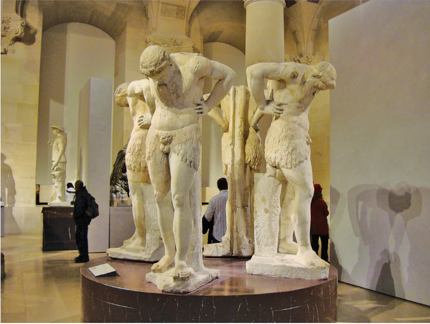
FIGURE 14.2. Satyres en atlante . Four statues depicting omphaloskepsis . 2nd Century. Roman, Marble. Louvre Museum. Wikimedia Commons.

religious rituals that were increasingly deemed pagan and outlawed. Numerous Christian monasteries were built on Mount Atos, correlating to a decline in Greek devotion to the Olympian gods and the power of Delphi and the Oracle. In 393 ce, Emperor Theodosius ordered the closing of all pagan sanctuaries including Delphi, which was taken over by Christians and finally abandoned in the seventh century (Scott, 2015; Beaton, 2021).