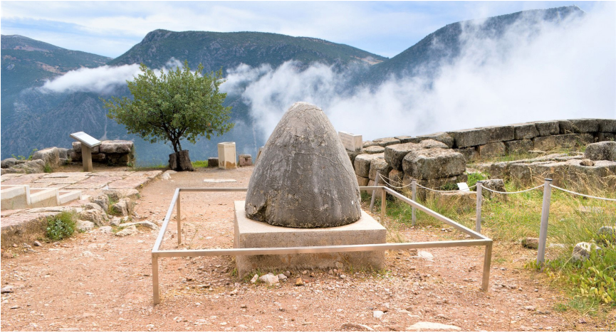
FIGURE 14.1. The navel or omphalos stone. Delphi, Greece, 2021.