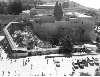
FIGURE 39. Mughrabi Gate ramp and excavations.

increasingly impinged on Palestinian entitlements to live in the city and claim a part in its historical and religious heritage, has completely blurred the lines between archaeological projects that are to the benefit of all religious and national communities and projects that are politically motivated. The painstaking nature of the planning procedures and the assurance to follow the highest professional standards have done little or nothing to quench the distrust of Palestinian residents, which is based on numerous prior so-called salvage excavations carried out in the occupied sector of the city.