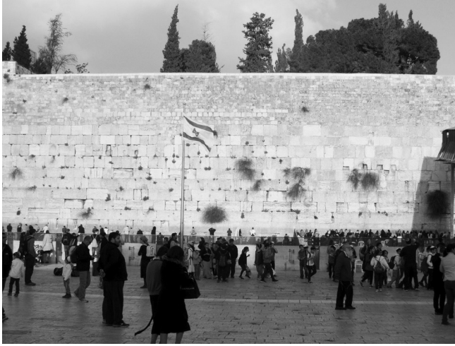
FIGURE 40. Western Wall.

first raised by Baron Rothschild in 1887, a plan that was only executed in 1967. 51 In contrast to the minor attention that the neighborhood adjacent to the wall received from residents, visitors, and scholars of ancient Jerusalem, an area which housed buildings ranging in date from the early Ayyubid period through the late Ottoman period, including houses of worship, the wall itself started to absorb the concern and care of the local communities and professionals as early as the beginning of the twentieth century. In 1920, Muslim authorities began conducting minor repairs to the Western Wall's upper courses. Though the Jewish community agreed that the work was necessary, they appealed to the British authorities, requesting that the conservation initiatives be carried out under the supervision of the newly established Department of Antiquities, recognizing the wall as part of a historic monument requiring specialized treatment. 52 A decision was then taken to place the maintenance of the small, upper stone courses under the authority of the Supreme Muslim Council (SMC), while the lower Herodian and Umayyad masonry was to be preserved by the Department of Antiquities, a decision challenged by the Mufti of Jerusalem. This partition of responsibilities was reiterated a number of times but has rarely proved itself as a viable means to adequately solve conservation problems. 53