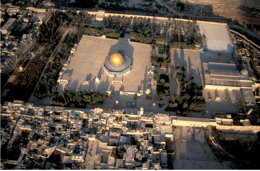
FIGURE 36. Aerial view of the Haram al-Sharif, looking east.

destroyed Jewish Temple, however, is documented in historical sources from the early Islamic period. 2 Subsequently, the same site has been venerated by Muslims as the location of the “Farthest Mosque” mentioned in the Qur’an (17:1), marking the place of Muhammad’s miraculous Night Journey to heaven ( Surah al-Isra ). In Muslim tradition, it was Ishmael, the ancestor of the Arab people, rather than Isaac, whom Abraham prepared to sacrifice (Qur’an 37:100–106).