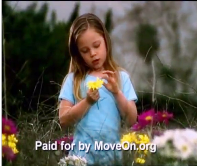
FIGURE 3.2. MoveOn's remake of the "Daisy" ad generated controversy and coverage, demonstrating the power of media for online organizing.

like Jack Black, Russell Simmons, and Michael Moore. 26 Citing a policy against advocacy advertising during the game, CBS declined to sell MoveOn the spot. But the winning ad and the controversy the contest generated nonetheless earned an enormous amount of free publicity for MoveOn. 27 MoveOn continued to make political advertising a primary tool in its efforts throughout the next few years, spending over $10 million airing its own material in the 2004 election alone. 28